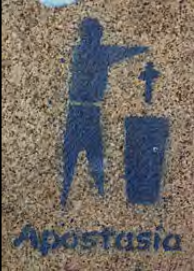
Logo of The Campaign for Collective Apostasy in Spain, calling for defection from the Catholic Church