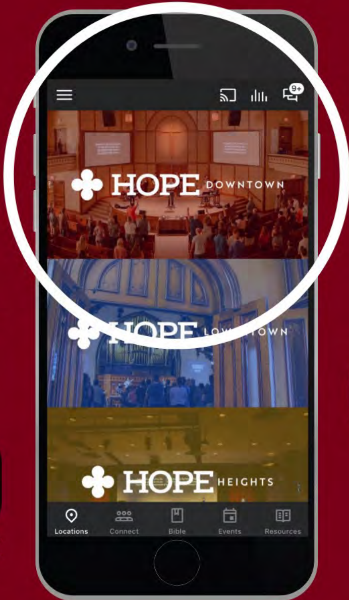
Select 'Hope Downtown'