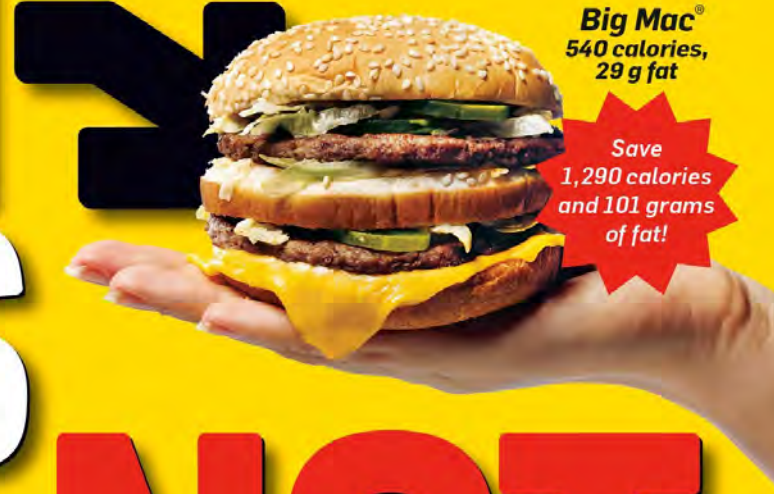
Big Mac® 540 calories, 29 g fat

Save 1,290 calories and 101 grams of fat!