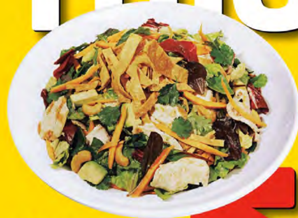
Cheesecake Factory Chicken and Avocado Salad 1,830 calories, 130 g fat